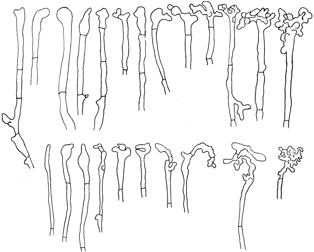
Fig. 2. Tips of paraphyses in heated cotton blue. Magnification ca. 1000 x. — Upper row: T. pusilla (type). — Lower row: T. spurcata (as in Fig. 1).

hymenium of T. spurcata ). T. pusilla differs from T. spurcata in possessing practically sessile, thin, very small apothecia which only measure ca. 0.5 cm in diameter, the narrow zone of t. angularis of the excipulum, only being ca. 35–50 \mu\text{m} broad, the very regularly ellipsoid spores, which are 11.5–13.0 \mu\text{m} broad (Fig. 1a), and the paraphyses which are 2.5–4.0 \mu\text{m} (to 12 \mu\text{m} apically) in diameter (Fig. 2: upper row); it was found growing in moist moss on a calcareous rock face. T. spurcata has larger apothecia, which at least reach a diameter of 4.5 cm, thicker context, a more distinct stipe ca. 2–7 mm in length, ca. 70–100 \mu\text{m} broad zone of t. angularis , on the average slightly thinner, 10.0–12.0 \mu\text{m} broad spores, which generally have slightly narrower ends, a part of them thus not being exactly ellipsoid but tending to be subfusiform (Fig. 1b), and slightly thinner paraphyses which for the greater part only