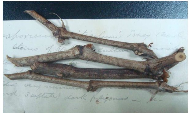
From type BPI0406485