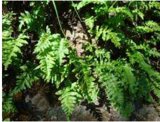
Host: Pteridium aquilinum