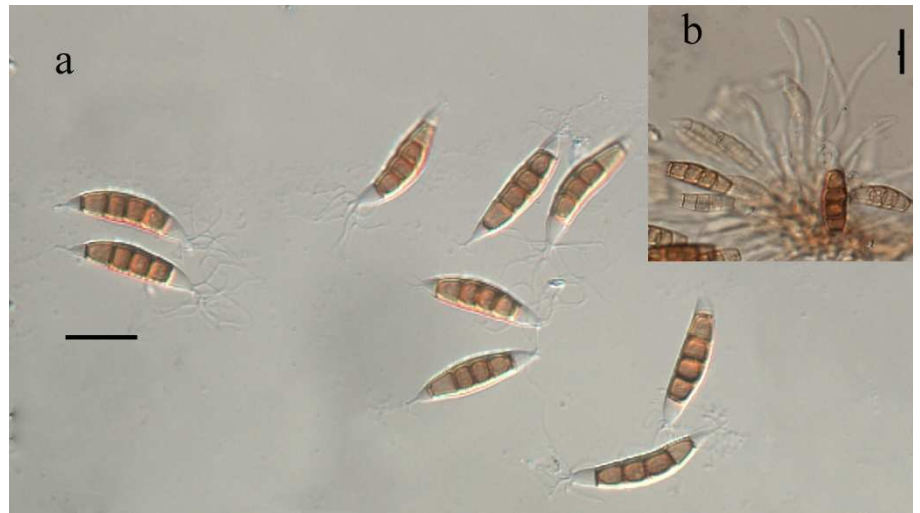
From BPI0406483, Scale bars: a-b = 20µm