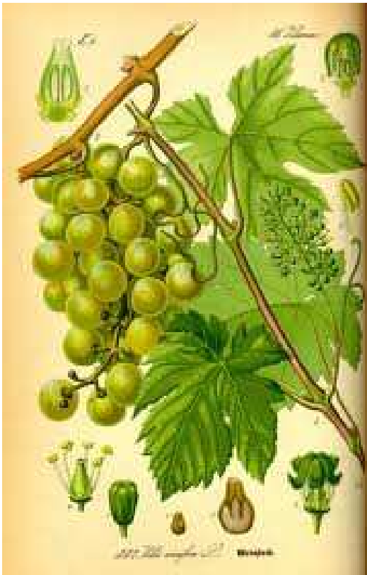
Host: vitis vinifera