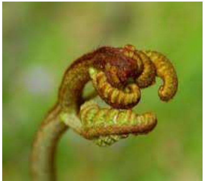
Host: Pteridium aquilinum